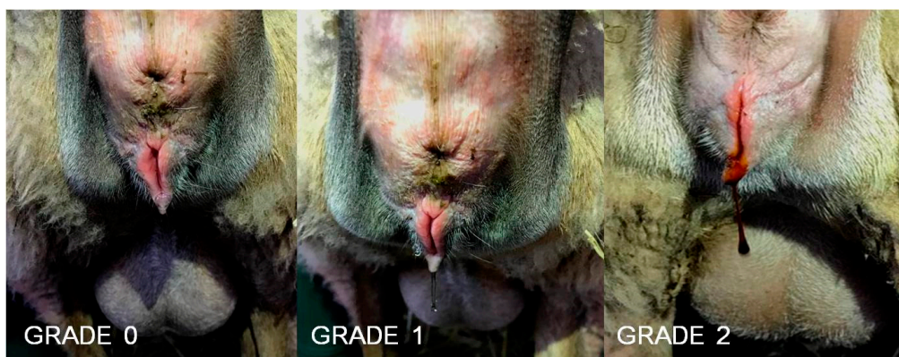
Figure 1. Scoring of vaginal discharge at intravaginal device removal: 0—negligible or no discharge; 1—some amount but clear discharge; 2—abundant amounts and hemorrhagic or purulent.

The intravaginal device was withdrawn on the same day in all the animals and therefore, animals in short treatments had 7 days of treatment with the device, animals in long treatments had 14 days, while control animals had zero days. At intravaginal device withdrawal, characteristics of vaginal discharge (i.e., amount, odor, whether purulent or hemorrhagic) were scored (0—negligible or no discharge; 1—some amount but clear discharge; 2—abundant amounts and hemorrhagic or purulent; Figure 1). Immediately, a sterile swab (Cary Blair sterile transport swabs, Deltalab, Barcelona, Spain) was used to collect mucus samples from the posterior region of the vagina (4 to 5 cm into the vagina), which were sent to the laboratory for bacterial culture. Finally, vaginal mucus pH was evaluated using pH-indicator strips (Merck KGaA, 64,271 Damstadt, Germany; working range pH 6.5–10.0).