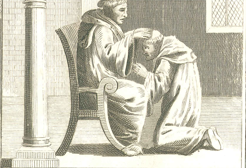
The Monk receiving Absolution to poison the King.