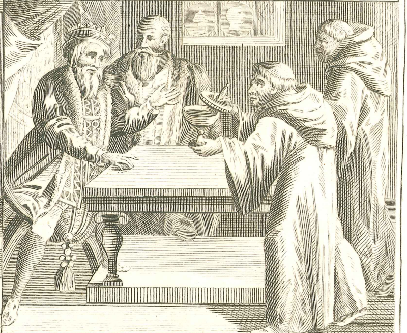
The Monk presenting the Cup of Poison to the King, having first drank himself.