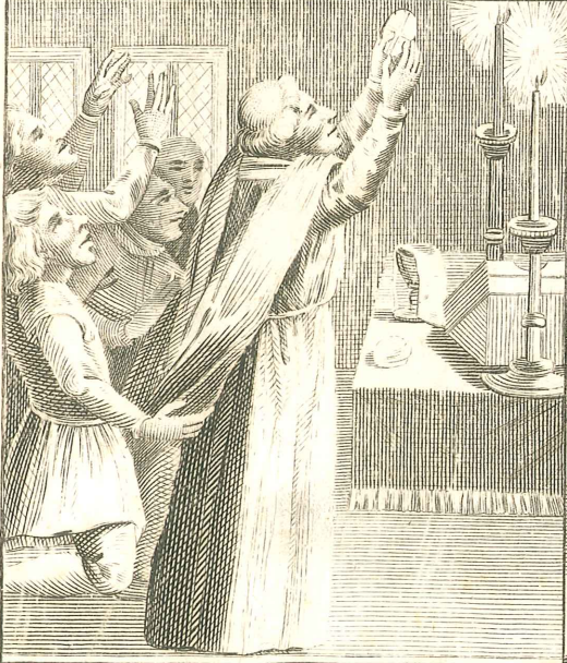
The Mass as sung daily in Swinsted Abbey for the Monk that poisoned King John.