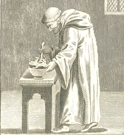
The Monk preparing the Poison in a Cup.