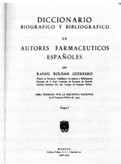
Fig. 43. Cubierta de la obra bio-bibliográfica de Rafael Roldán sobre los farmacéuticos españoles