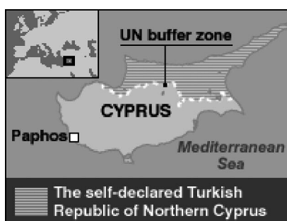
Figure 4. Cyprus

The first action of a divided Cyprus (see Figure 4) as a EU member was to block this gesture. The EU insists that Ankara must first fulfil its obligation to open its ports and airports to their traffic and thus recognise the Republic of Cyprus. Recip Tayyip Erdogan, the Turkish prime minister, feels betrayed by the EU after Ankara successfully encouraged Turkish Cypriots to accept the Annan Plan.