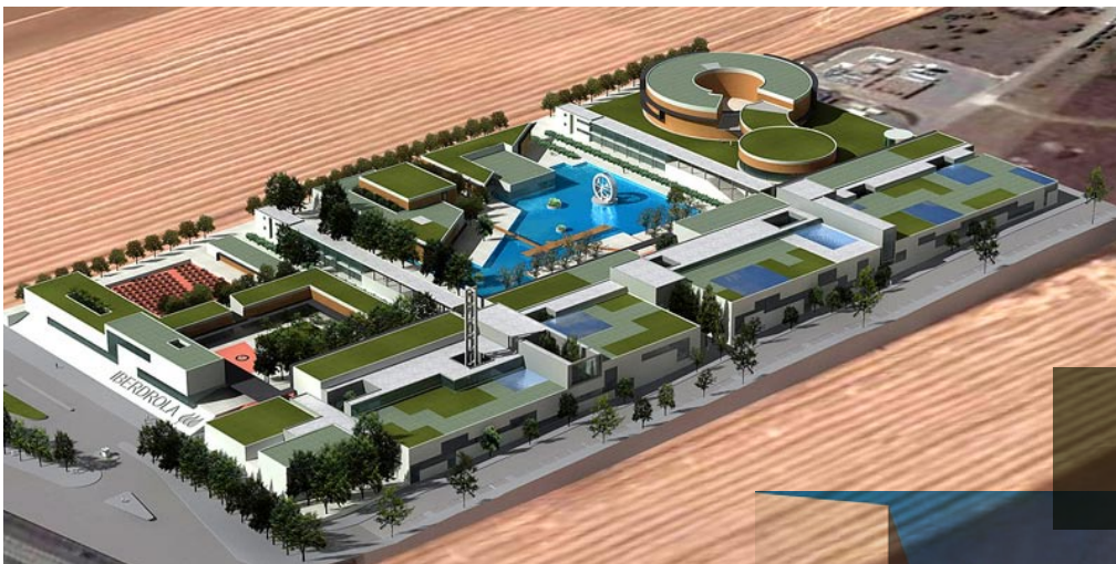
General view from the east