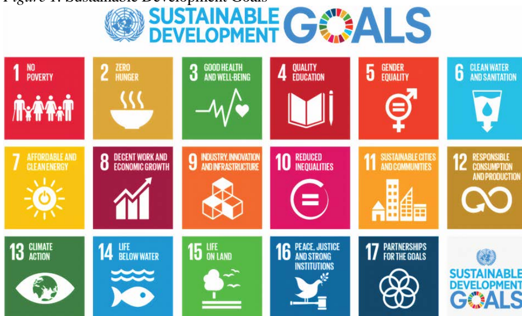
Figure 1. Sustainable Development Goals

Those sustainable goals are shown in Figure 1.