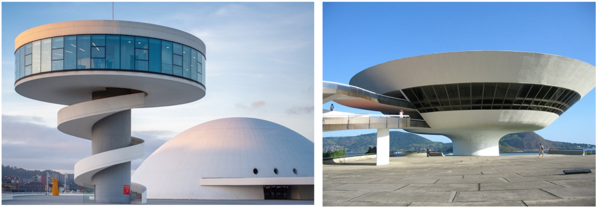
Figure 6. Examples of buildings whose original idea could involve the use of an equilibrium challenge, Oscar Niemeyer International Cultural Centre (Spain), Niterói Contemporary Art Museum, Brazil (Oscar Niemeyer).

Finally, students must draw their building, give it a name, design a logo and generate the storytelling of their project, to finally record a video in which they present the designed building and its main qualities. As it is a more complex and elaborate challenge, students will have two weeks to develop it.