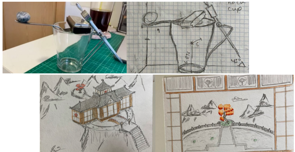
Figure 9. Thenjou.