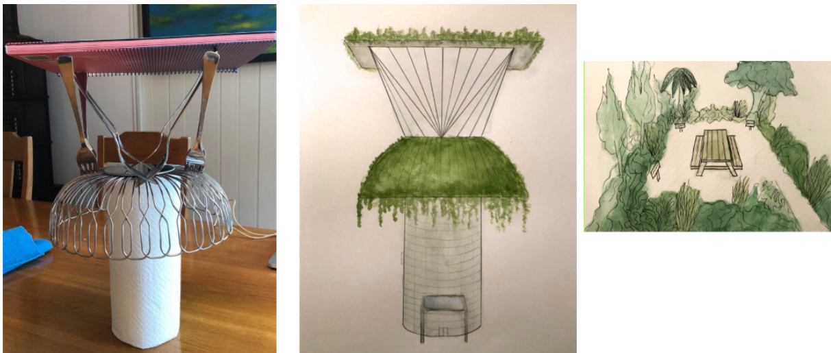
Figure 7. The Hanging Garden Conservatory.

This challenge will be carried out on Christmas holidays and therefore, students have two weeks to design their building. Figures 7–9 show three examples of the students' proposals.