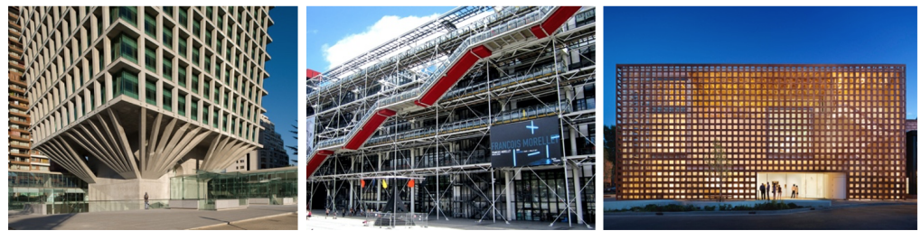
Figure 4. Examples of buildings whose structure can be seen: (left) Building Cruz del Sur, Chile (architects Izquierdo and Lehmann, (middle) Centre Pompidou, Paris (architects. R. Piano, R. Rogers), (right) Aspen Art Museum, USA (S. Ban).

The development of the challenge is specified below: