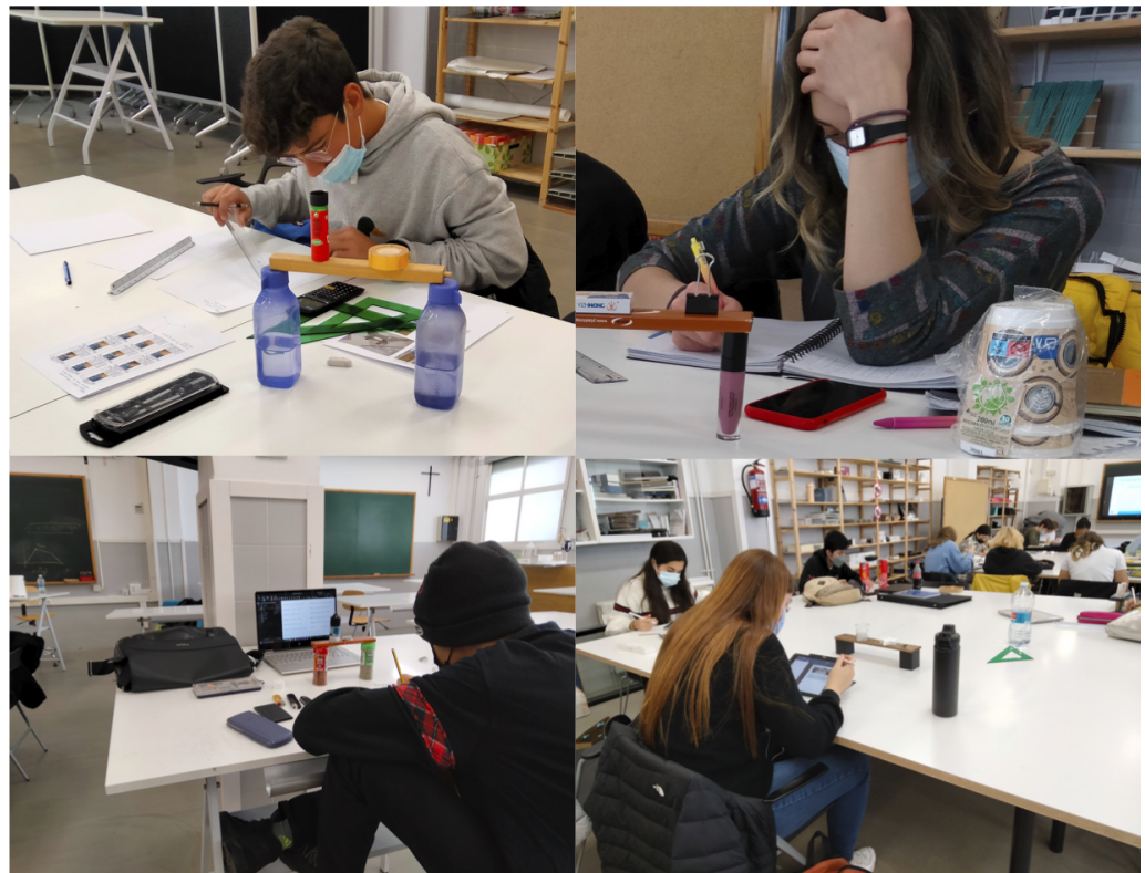
Figure 5. Students developing the bending equilibrium challenge.