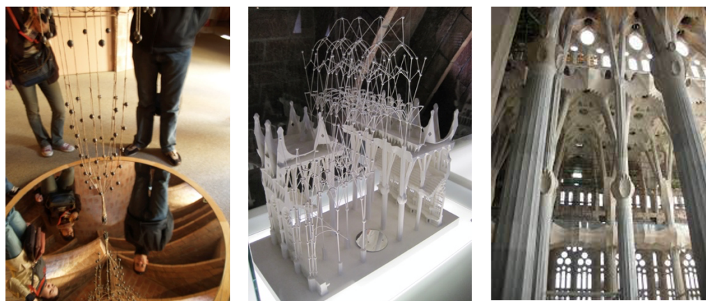
Figure 1. Catenary arches used by Gaudí (1852–1926), (Left). Museum of Casa Mila (Centre), La Pedrera building (Right), Barcelona (Spain).

The theme of this challenge is inspired by the viral challenge with the same name that can be easily found online: the "Pringles ring", an autonomous ring-shaped structure made entirely of the classic potato crisps. This equilibrium challenge allows students to experiment with the physical concepts of centre of gravity, friction, warped surfaces, in particular the hyperbolic paraboloid and its geometric and physical properties. The whole workshop begins with the verification of how vector geometry is able to become an inspiring source to make a building, using as an emblematic example in this part, the works of experimentation and construction by the Spanish architect Antonio Gaudí, see Figure 1.