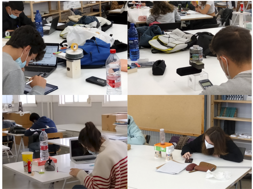
Figure 3. Students developing “The equilibrium challenge”.