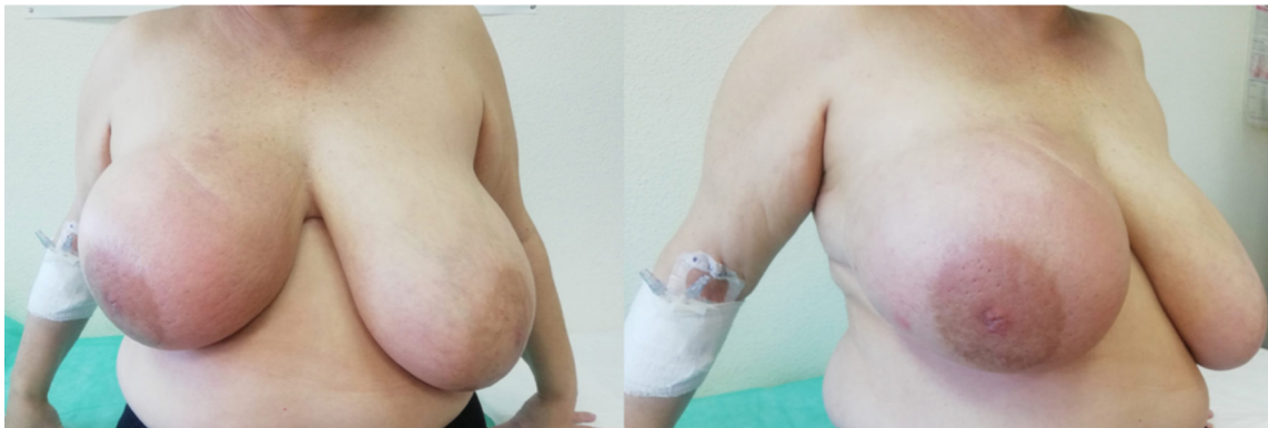
Figure 1. Physical examination revealed breast asymmetry with edematous cutaneous signs”.

We present a 45-year-old woman, with early-detected family history of breast cancer, who referred thoracic thrombophlebitis and mammalian asymmetry of months of evolution. Gigantomastia was found during the physical examination (Figure 1). Breast asymmetry was evident with increased right breast volume. Skin thickening and cutaneous inflammatory signs could be also described. No other anomalies were found.