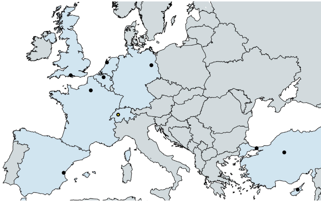
Figure 1 Centres currently participating to the EPIC-PCD cohort study. The EPIC-PCD clinics are marked with a black dot and the EPIC-PCD data centre with a yellow dot. EPIC-PCD, ear–nose–throat prospective international cohort of patients with primary ciliary dyskinesia.

be small variations in recruitment and data collection between participating centres to allow the study to be embedded in the regular clinical routine.