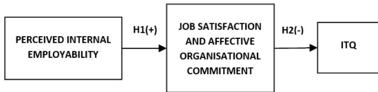
Figure 2. Final research model.

As a consequence of the above methodological development and by way of summary (table 3), results showed that internal employability did positively and strongly impact on satisfaction and commitment in the same way that satisfaction and commitment negatively and strongly impacted on the intention to quit, thus entailing acceptance of the hypotheses proposed in the final research model.