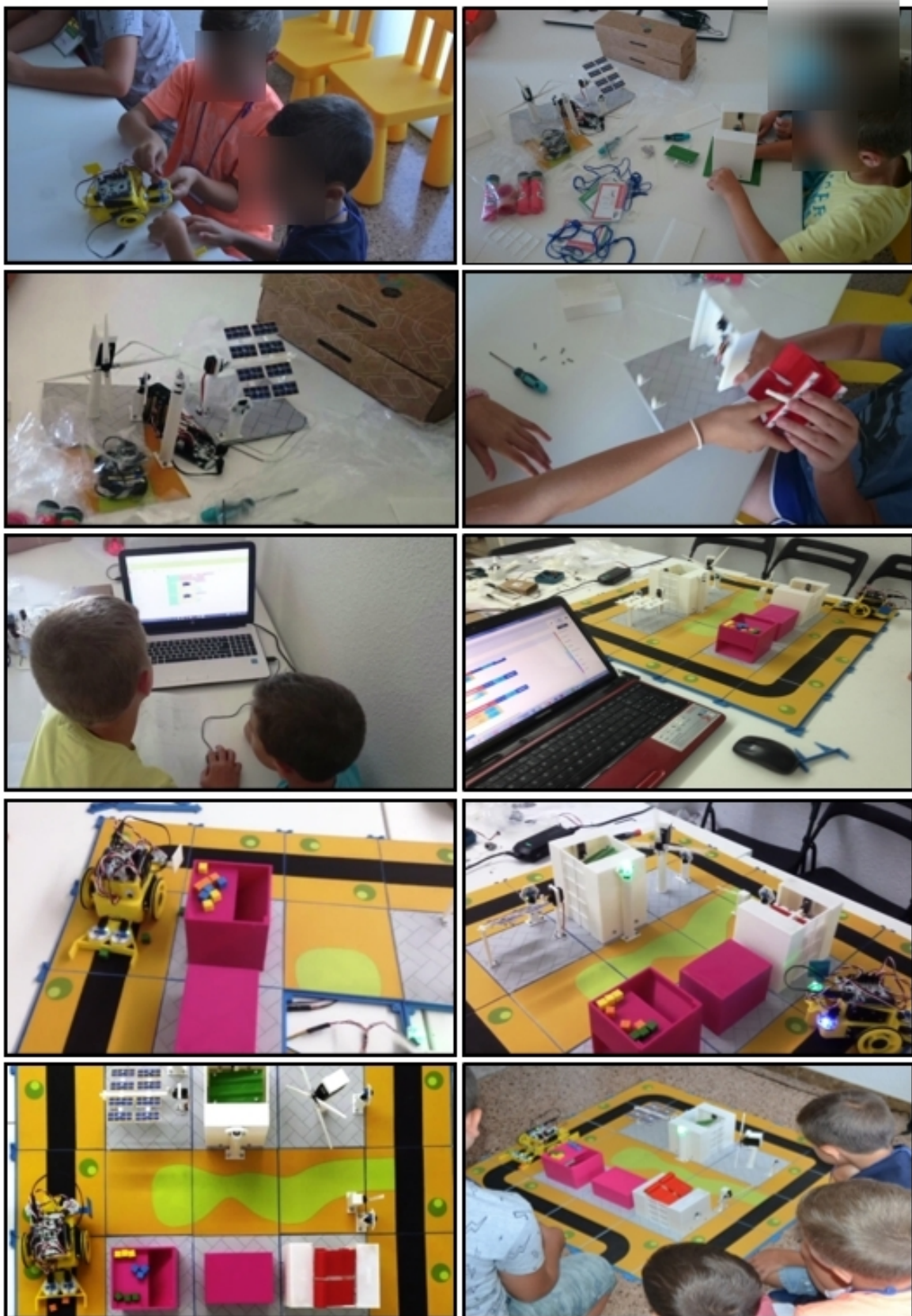
Figure A1. Images of the project development.