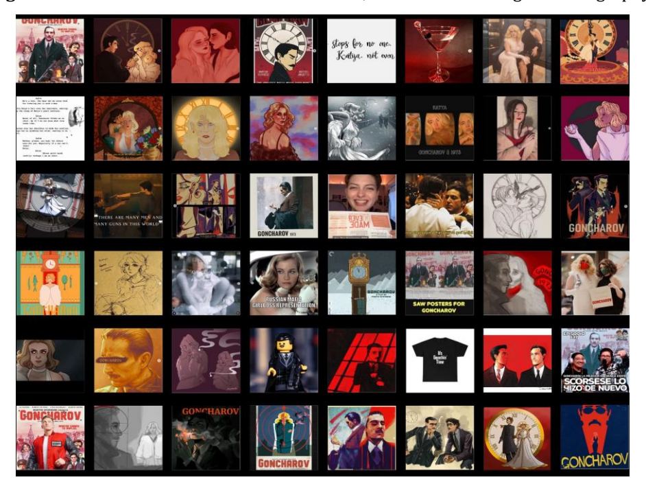
Figure 4. A selection of Goncharov fan creations, drawn from the digital ethnography

most prevalent, but also serves as a lingua franca for users from different countries to share their creations pertaining to Goncharov. Nevertheless, a number of publications have been identified in other languages, including Spanish. In terms of content type and format, fanart —particularly digital illustrations created with software such as Procreate— is the most widespread. However, the study has recorded a broad range of fan content, including cosplay, games, merchandising, fantrailers, memes, promotional posts about podcasts discussing Goncharov, and even a song from the film's soundtrack, "Katya's Song". Figure 4 below offers a visual representation of the fandom's creations, as observed through the digital ethnography.