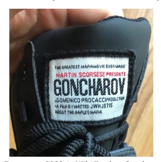
Figure 1 . Boot label that gave rise to the Goncharov phenomenon

The starting point of this article is anchored in the conceptualisation of Goncharov as a fictional film, which has been designated as Scorsese's "non-film" (Aznal, 2022; Cain, 2022; Meeks, 2022; Sung, 2022)'. Its genesis is attributed to a label on the reverse of a pair of boots (De Partearroyo, 2022; Kircher, 2022; Pérez, 2022). On 22 August 2020, Tumblr user Zootycoon posted an image of the label on a pair of boots purchased online, accompanied by the following comment: "I got these knockoff boots online and instead of the brand name on the tag they have the name of an apparently nonexistent Martin Scorsese movie" (Zootycoon, 2020 in Wiki Fandom Goncharov, 2022). It must be acknowledged that the provenance of the label remains unproven. However, given that the item in question was placed on counterfeit footwear, some commentators (De Partearroyo, 2022) have speculated that the error may have been a typographical one, with the label in fact reading 'Gomorrah' – a reference to the celebrated Italian television series about the Camorra, which Scorsese supported for its distribution in the United States.