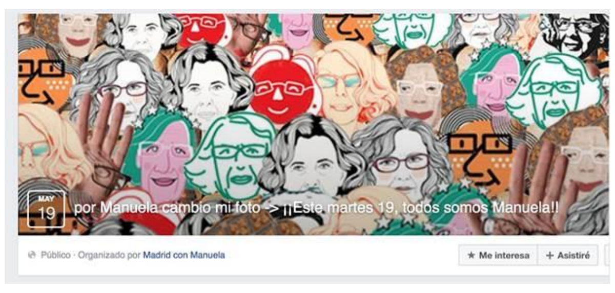
Figure 3. Action in Facebook on 19 May 2015

In this sense, and like this paper, Dader, Cheng, Campos, Quintana and Vizcaíno-Laorga (2014) state that the analysis of the websites of political parties in campaign constitutes the witness of the evolution of communication strategies not only from the party, but it also represents a contribution to a general level within the study of the political communication.