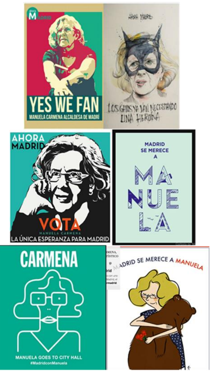
Figure 2. Graphics used during the citizen campaign

a practically unknown party for majorities, and coming from a citizen movement (the 15M), obtained unexpected results positioning in the European Parliament. The intelligent management of social networks and online channels had a lot to do with this surprising result. As was also observed in the focus of this study.