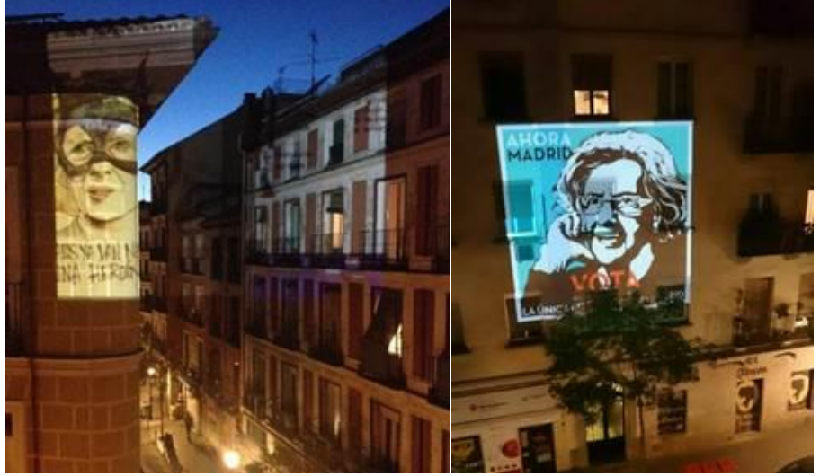
Figure 4. Guerrilla Marketing actions in outdoor media

And with these data the following questions arises: how is it possible that with these scarce resources there could be a campaign against very well positioned and potent rivals such as PP and PSOE?". The answer is conclusive, only by using tools as potent and innovative in the political dispute such as Artivism and Grassroot , we mentioned earlier in this study.