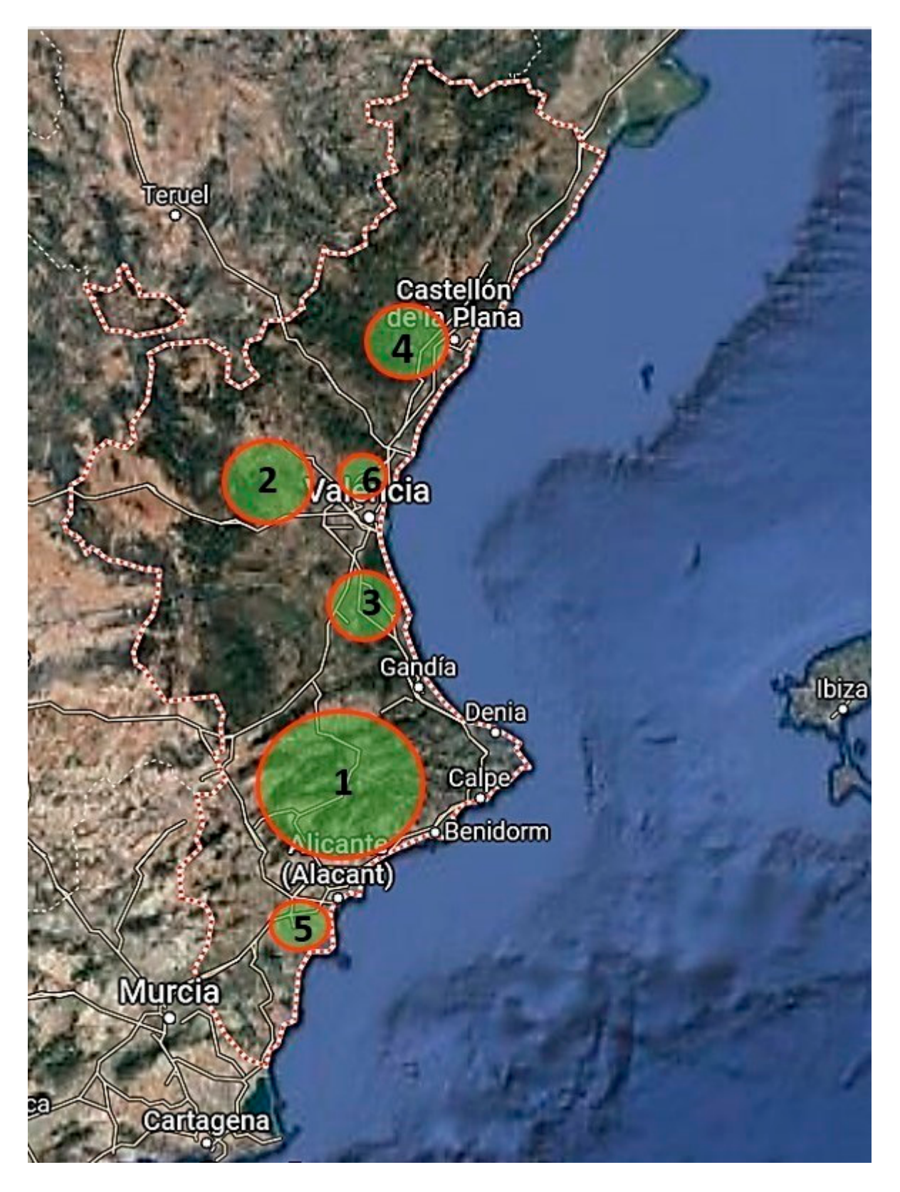
Figure 1. Map of business clusters in the Valencian Region.

Cluster 3, to the south and inland of the city of Valencia, in the locality of La Ribera, has as its main activities chemistry, auxiliary furniture, and wholesale trade.