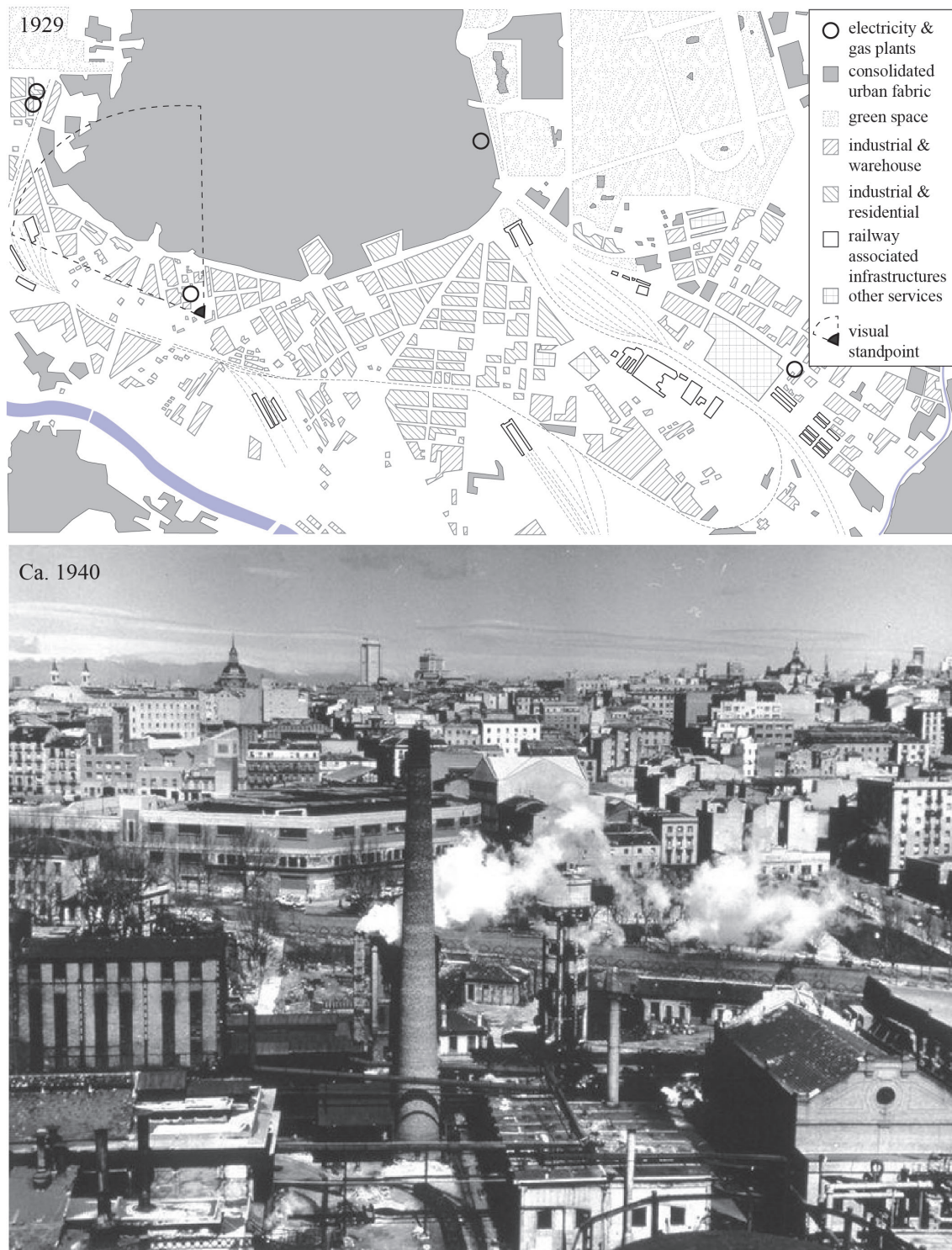
Figure 1. Industrial fabric in the south of Madrid in 1929)