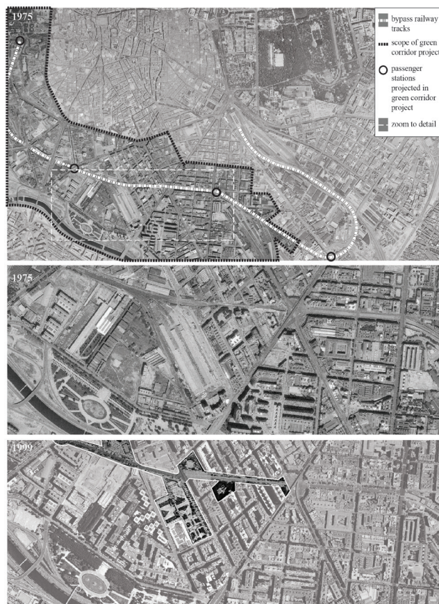
Figure 3. Urban regeneration plan for the south and west interior border of Madrid in the late twentieth century: Pasillo Verde