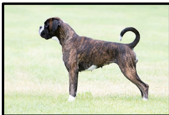
Figure 1. Photograph of adult male of boxer breed.