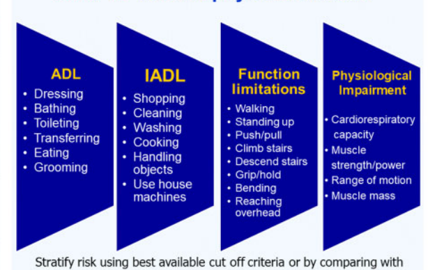
STEP 2: Assess physical function